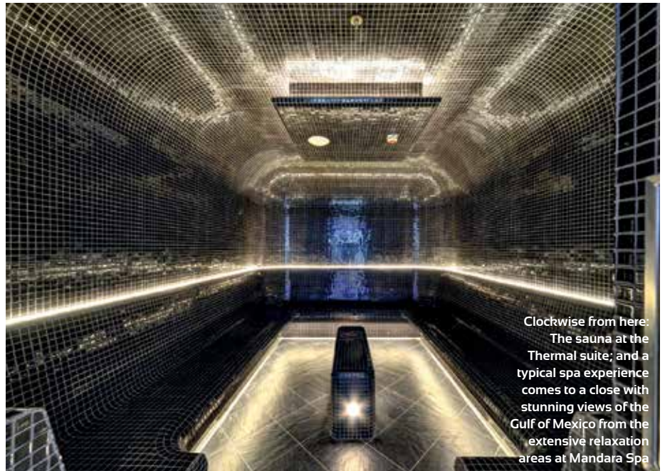
Clockwise from here: The sauna at the Thermal suite; and a typical spa experience comes to a close with stunning views of the Gulf of Mexico from the extensive relaxation areas at Mandara Spa

thermal suite had, within its confines, jacuzzis and jet sprays of cold, warm and hot water, sauna and steam rooms along with a space for salt therapy. I soaked and sweated in each of them by turns, before finally plonking on one of the heated wooden deckchairs by the bay windows to soak in the mild autumnal sunshine. 🌿