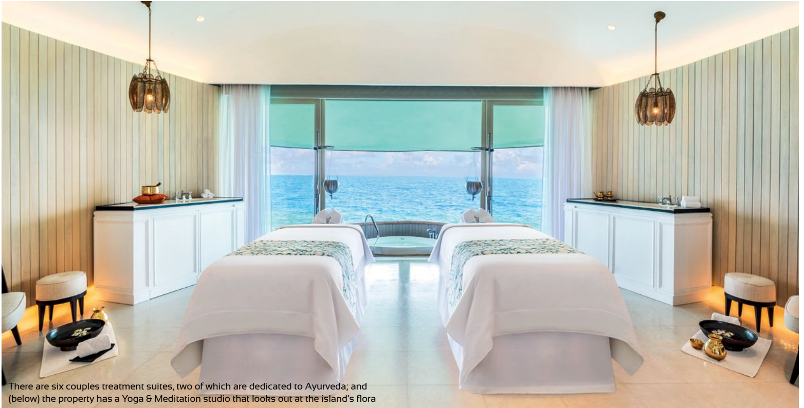
There are six couples treatment suites, two of which are dedicated to Ayurveda; and (below) the property has a Yoga & Meditation studio that looks out at the island's flora