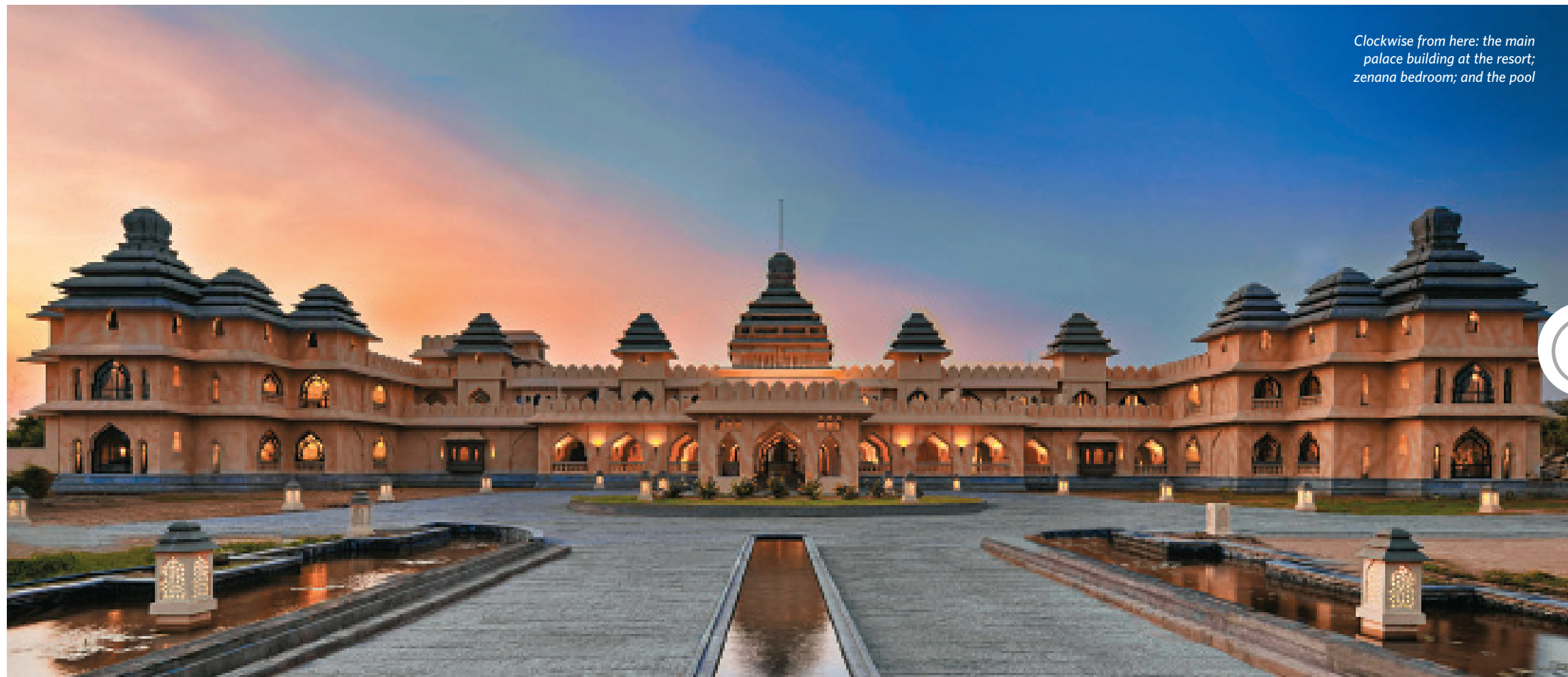
Clockwise from here: the main palace building at the resort; zenana bedroom; and the pool